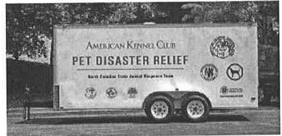
Image is for illustrative purposes only and does not necessarily represent final trailer design.

AKC Pet Disaster Relief helps local Emergency Management provide