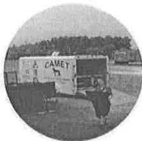
Trailer arrives at site

Image is for illustrative purposes only and does not necessarily represent final trailer design. Logo placement is at the discretion of AKC Reunite.