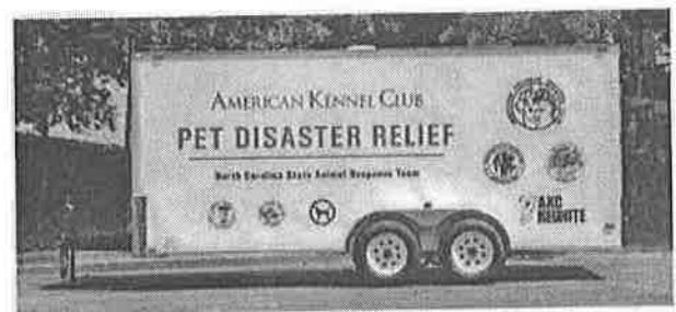
Image is for illustrative purposes only and does not necessarily represent final trailer design. Logo placement is at the discretion of AKC Reunite.

"I'm relieved, I don't care about the house, I don't care about anything else now. We're okay. We're all alive. We have our family, our dog, we're going to be okay."