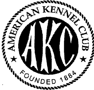
The American Kennel Club