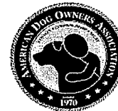
Member of the American Dog Owners Association

The Northern New Jersey Great Dane Club, the Officers, Board Members and Members would like to welcome you to our website and thank you for taking the time to visit it.