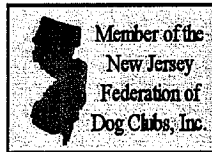
Member of the New Jersey Federation of Dog Clubs