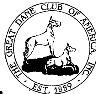
The Great Dane Club of America